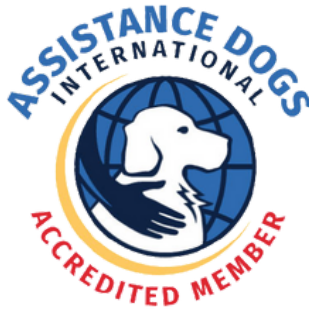
Assistance Dogs International Logo