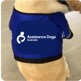
An Assistance Dogs Australia accredited Assistance Dog in its jacket