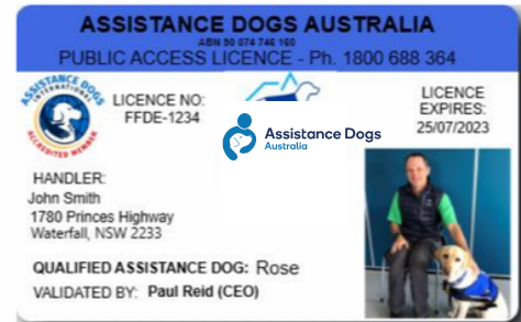
A Public Access Licence denoting the legal rights of the handler and showing the details of the handler, dog and accrediting organisation