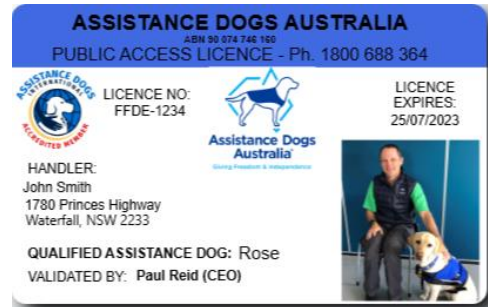
A Public Access Licence denoting the legal rights of the handler and showing the details of the handler, dog and accrediting organisation