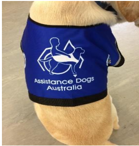
An Assistance Dogs Australia accredited Assistance Dog in its jacket