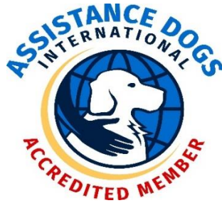
Assistance Dogs International logo