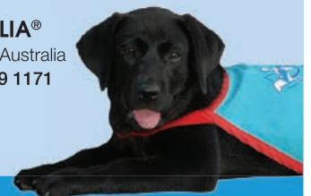
ABOVE

ASSISTANCE DOGS AUSTRALIA® PO Box 503, Surry Hills NSW 2010, Australia Toll Free: 1800 688 364 Fax: 02 9699 1171 info@assistedogs.org.au assistedogs.org.au