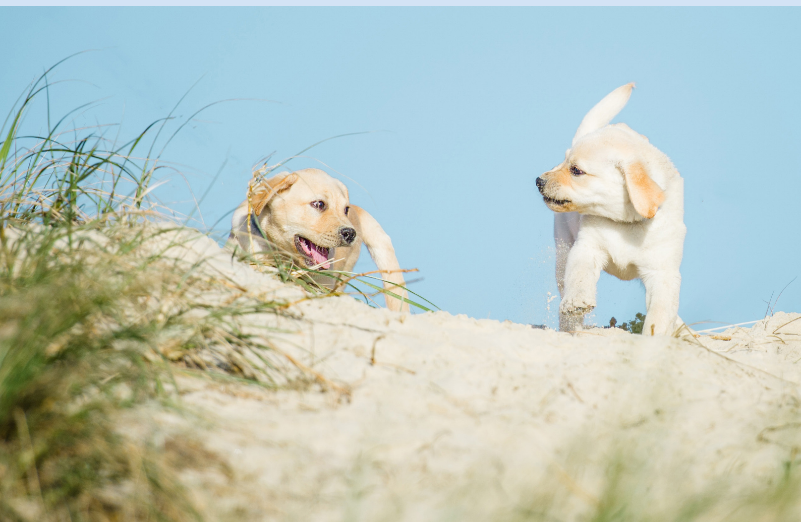
ABOVE: Parker and Lucky enjoying time out.